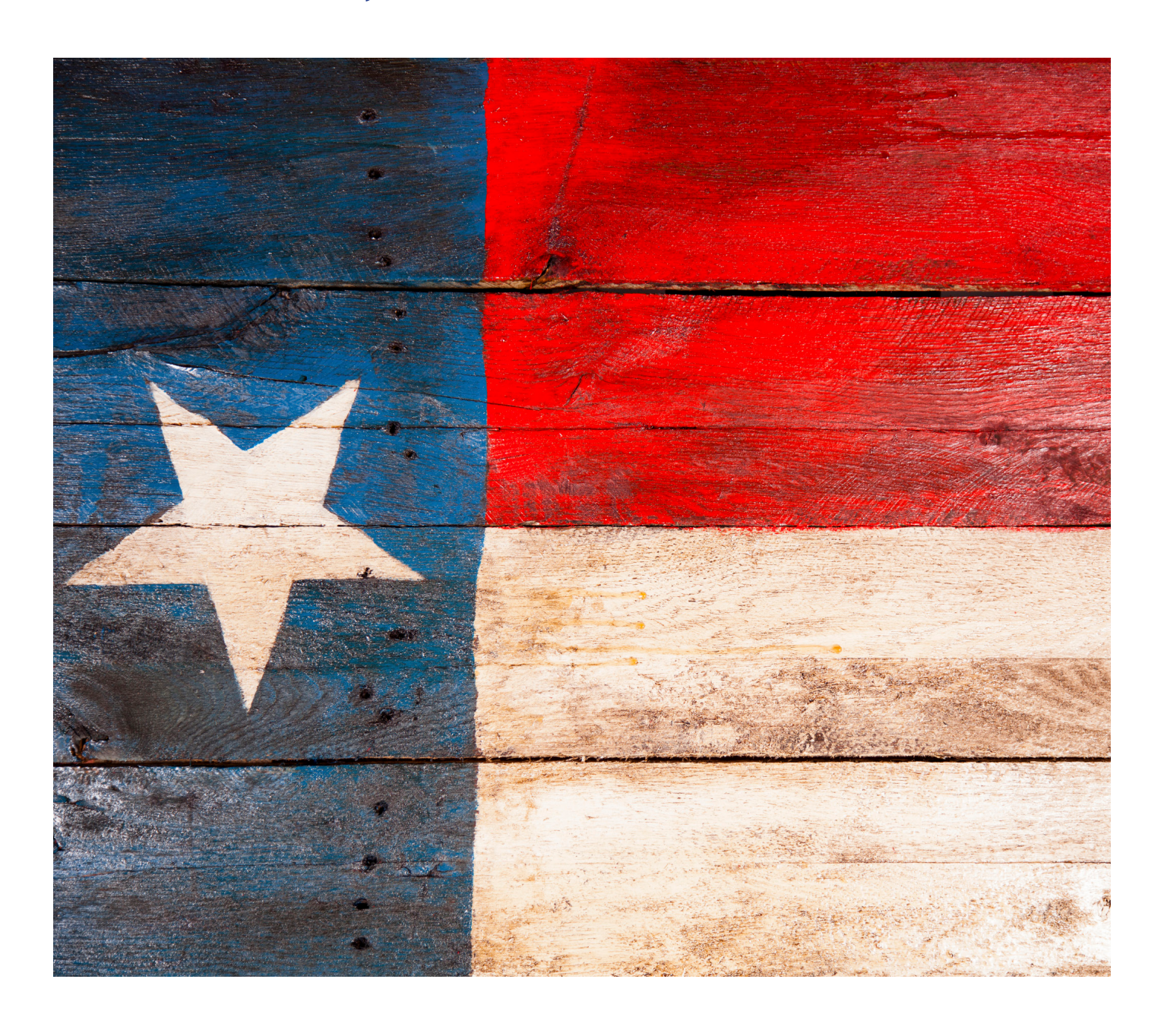
TEXAS March 10 – 16, 2023